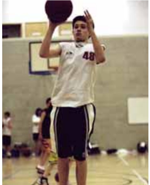
Providing advice and guidance for local sports clubs