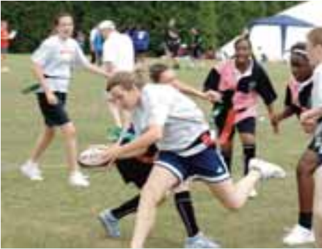
London Youth Games and Mini Games