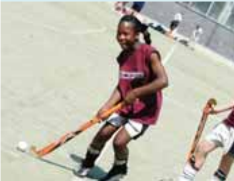
Delivering regional and national Sports Development programmes within Bexley